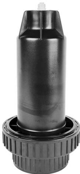
Submersible Pressure Bell

These systems completely replace mercury and mechanical floats and their wires that twist, tangle and foul with floating debris. They also take the place of costly transducers, probes that corrode and other such devices. A huge innovation is that all settings and adjustments are made outside of confined space (basin) and there are absolutely no electrical level system components in wet areas. The foundation of the Pressure Activated Control systems is our proprietary pressure bell. The pressure bell is non-electric and transmits a pressure only signal to the controller. No voltage from the level-sensing device enters the wet well. As the water level rises in the basin, pressure is created in the pressure bell sending an air pressure only signal to the controller. In fact, installation of the pressure bell is as simple as mounting the bell and connecting it to the control panel using the provided 1/4" poly tubing (50 ft comes standard with most systems). Numerous control systems are available utilizing the pressure bell technology ranging from simplex to quadraplex and with the addition of the new Titan Series this technology can be built into virtually any custom panel imagineable.